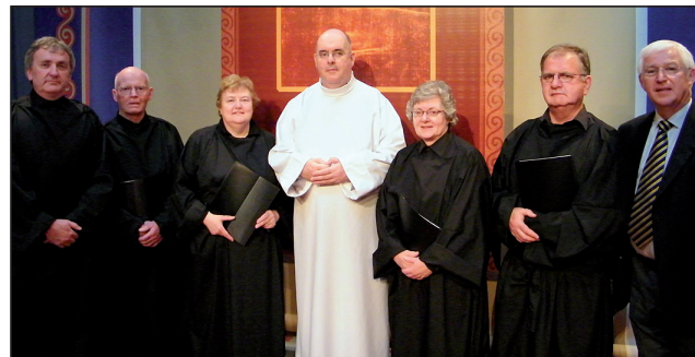
Dramatisation of The Passion on Good Friday.

Thursday and the Holy week ceremonies once again brought great crowds to St Mel's Cathedral Centre. Trócaire thanked the parishioners and clergy for standing in solidarity with the world's poor during this Lent.